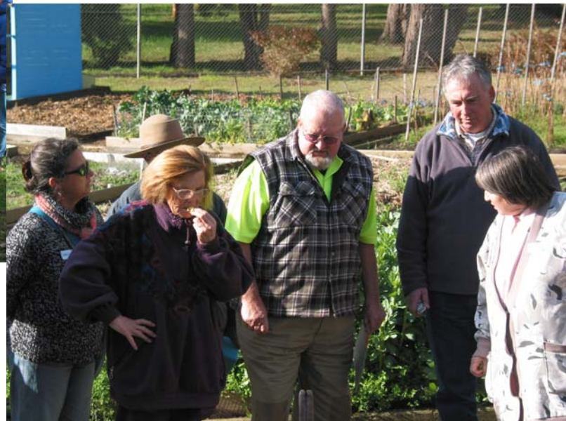
Creek Road Community Garden (above) & Punchbowl Community Garden (right) Walk & Talk Sessions